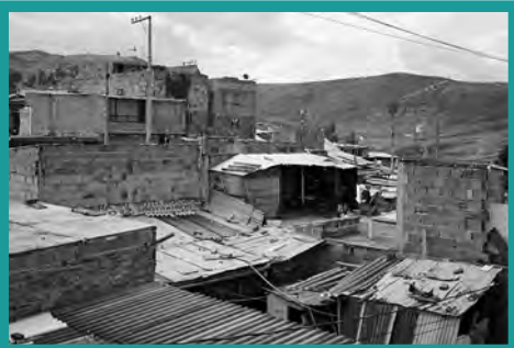
Homes in Barrio Paraiso Quiba built in installments as the people are able to work and improve their living conditions.