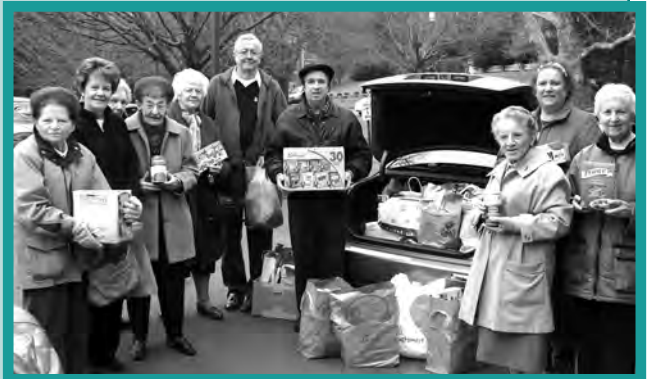
The Associates load up their cars for the journey to the Cor Unum Meal Center in Lawrence.

Update from the Toledo Our Toledo Associates had a wonderful Christmas gathering early in December 2008 at the St. Anne Mercy campus where they exchanged fellowship, shared music and enjoyed a potluck meal together. Gift cards were collected for the Marguerite d'Youville Program in addition to making a donation from our treasury. The Toledo Associates are busy now setting a calendar for the year, including general meetings, Executive Council meetings, retreat and commitment dates. They will be continuing to use the "Foundation in Faith" Handbook on Prayer at their general meetings. Another priority this year is to extend invitations to several people to join the Associates program and to set up an Orientation schedule.